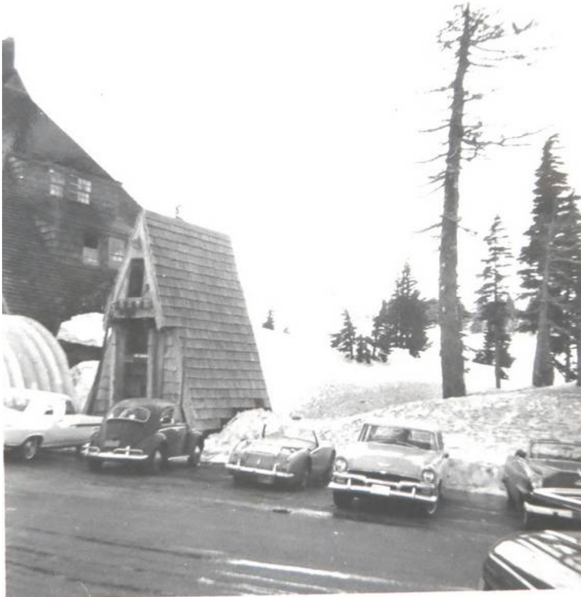
ANOTHER PICTURE OF PART OF THE LODGE AND THE MOUNTAIN