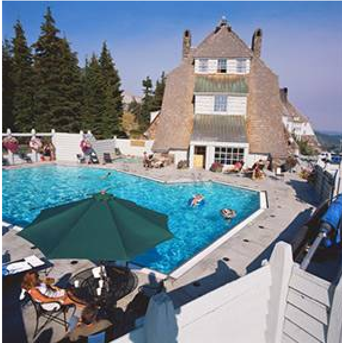
THIS IS ANOTHER PICTURE OF THE SWINING POOL AT THE LODGE